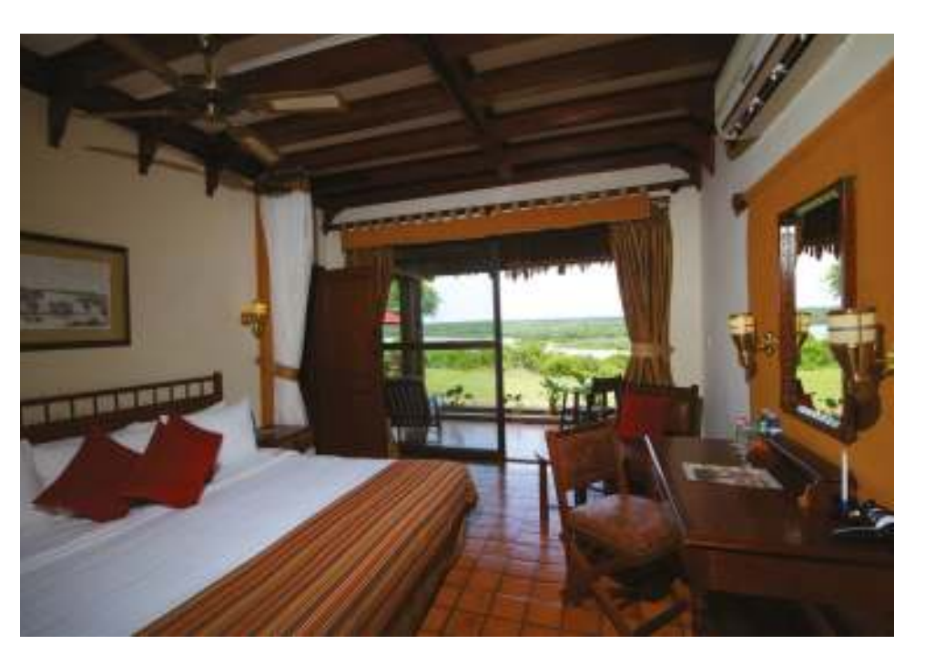
Our Deluxe Rooms (above) and Queen's Cottage (below)